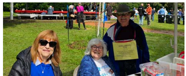
Bagel Loop 2023/2025