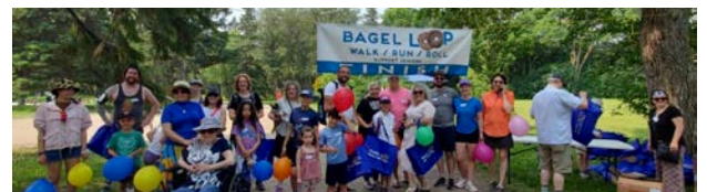
Bagel Loop 2019/2025