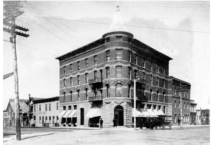
The Alberta Hotel in 1907, image via City of Edmonton Archives EA-500-121